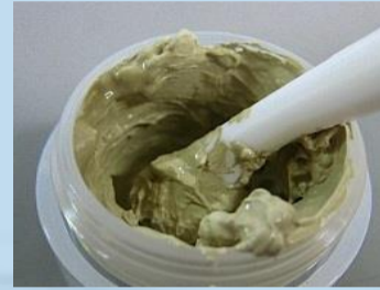
Rehydrated with excessive water

With PMC Aqua, you can feel much easier ! It has a broader allowance and enables you to obtain a well conditioned clay even when the used amount was a bit too much.