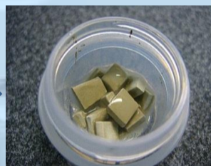
PMC Aqua added