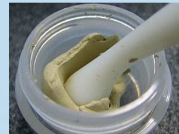
Rehydrated with excessive PMC Aqua